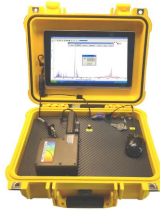
Rugged Case for "Open & Measure" Applications